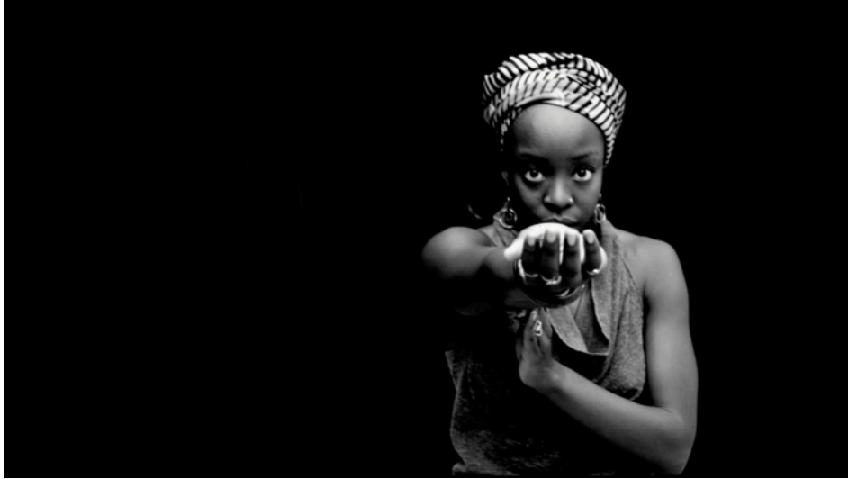
Sitting on a Man (video still). 2018.