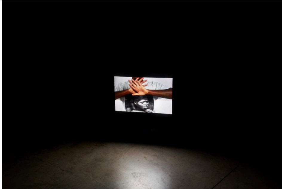
View of “Onyeka Igwe: A Repertoire of Protest (No Dance, No Palaver),” 2023, MoMA PS1, New York.