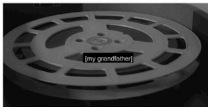
the names have changed, including my own and truths have been altered, 2019, video