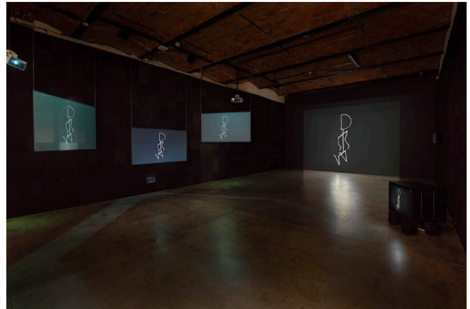
View of “Onyeka Igwe: A Repertoire of Protest (No Dance, No Palaver),” 2023, MoMA PS1, New York.

The three videos play sequentially (simultaneity would have produced an unhappy cacophony, and headphones would have meant sacrificing the potent effects of sonic immersion). In between, the fragmentary Notes on dancing with the archive (2023) takes over every screen, a riff on a countdown which also acts as a palate cleanser. During this seven-second video, animated stick figures act out the polyrhythmic dance notation developed by Nigerian playwright and choreographer Felix A. Akinsipe, infusing the show with a sense of playfulness and offering a perfect description of Igwe’s practice: dancing with the archive . The MoMA PS1 opening coincided with an evening of screenings for the museum’s Modern Mondays, including a so-called archive (2020). That video concludes with Igwe’s solo dance party in an empty warehouse of the Bristol Museums and Bristol Archives, where she was auditing material from the British Empire and Commonwealth Collection—the contents of which are scattered across the show at PS1.