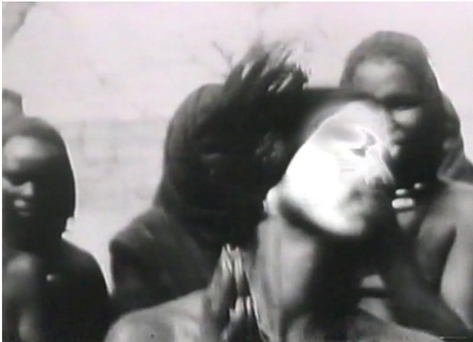
Onyeka Igwe, Specialised Technique , 2018, HD video, black-and-white, sound, 6 minutes 36 seconds.

“PULSE, PULSE, PULSE, PULSE, hold, and pause,” a voice-over evenly calls out as monochrome footage rapidly intercuts between a black woman alone on a stretch of grass—arms out and angular, the top of her body pulling toward the ground and her legs partially bent—and stick-figure notations of her dance. Minutes later, a clip of women swirling the voluminous white clothes tied at their waists unfolds, instead, at a mesmerizing and unsettling molasses pace. This archival footage is punctuated with intertitles: “What happened when you looked down the lens? Or did they tell you not to?” “I want to make the camera move too. At the same time.” These words appear as white text on a plain black screen, episodes of visual pause and verbal emphasis in the stunning assemblage of Specialised Technique (2018). The video is by Onyeka Igwe, a London-based artist whose practice is shaped around challenges to visual domination and an enduring desire for movement. Grounded in black women’s embodiment, her exhibition “A Repertoire of Protest (No Dance, No Palaver),” currently on view at MoMA PS1 in New York, reclaims a feminist inheritance of anticolonial resistance in Nigeria through reimagined choreographies of liberation. Igwe does not look at the archive, she sways and speaks with it, resurrecting what has long been sealed away in forgotten documents and dusty storage rooms.