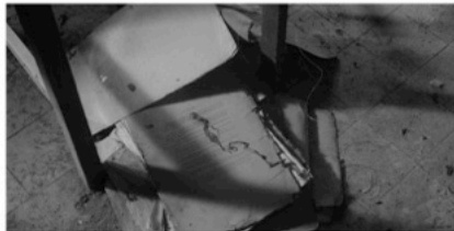
No Archive Can Restore You, 2020, video