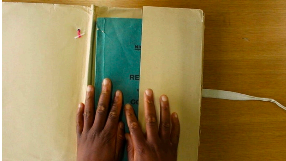
Onyeka Igwe, Her Name in My Mouth , 2017 , video, color, sound, 5 minutes 51 seconds.