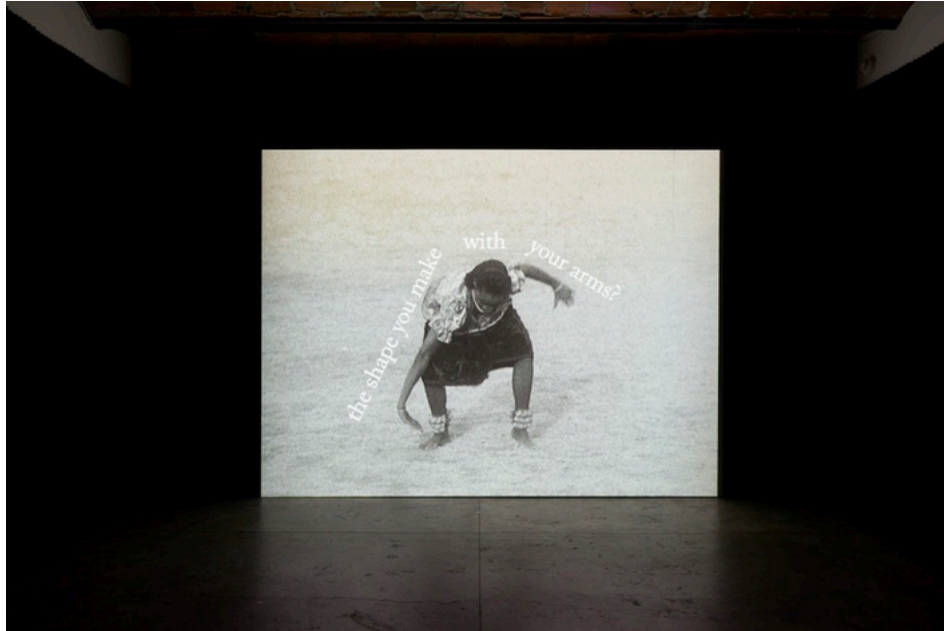
View of “Onyeka Igwe: A Repertoire of Protest (No Dance, No Palaver),” 2023, MoMA PS1, New York.

The polymorphic nature of Igwe’s work presses on a cyclical and vacuous preoccupation with classification and legibility that circumscribes the reception of many black artists, particularly women, whose aesthetic grammars intentionally evade containment by received categories of artistic expression. A productive, if still inadequate, framing is that of “expanded cinema.” This slippery term—which emerged in the mid-1960s to describe experimental practices that cannot be accommodated by the medium’s conventional exhibition model and that incorporate multimedia elements, restructure spectatorship toward participation, and trouble the framework of the filmic experience—is an apt one for an Igwe’s art, which shifts between cinematic and museum protocols.