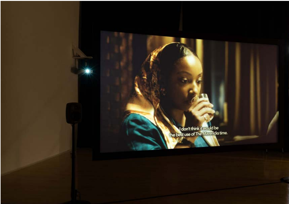
Onyeka Igwe "history is a living weapon in yr hand" at Bonington Gallery, Nottingham, 2024. Courtesy: the Artist, Arcadia Missa, London, and Bonington Gallery, Nottingham. Photo: Jules Lister

“history is a living weapon in yr hand” is a solo exhibition of new and reconfigured work by London based artist Onyeka Igwe. The exhibition follows Igwe’s acclaimed solo exhibition “A Repertoire of Protest (No Dance, No Palaver)” at MoMA PS1 in New York, earlier this year, and ahead of her inclusion in the exhibition “Nigeria Imaginary” at the national pavilion of Nigeria at the Venice Biennale 2024.