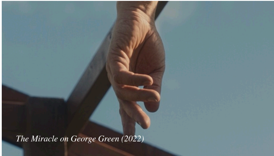
The Miracle on George Green (2022)